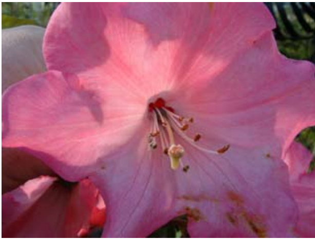
top left R. 'Aurora' - a griffithianum , fortunei , and thomsonii cross by Rothschild in 1922, it was itself a parent to the prolific 'Naomi' group.