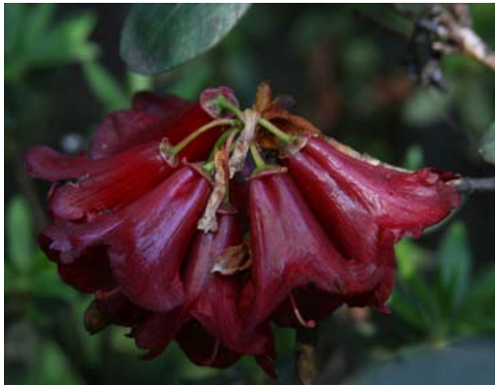
top right R. 'Oporto' - the almost edible 'Oporto' is a straight thomsonii ssp. thomsonii x sanguineum ssp. sanguineum var haemaleum cross by Nelson in 1965.