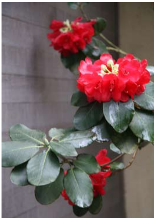
at left, a photo of R. thomsonii ssp thomsonii, at the Rhododendron Species Foundation. See page 6 for more thomsonii information.