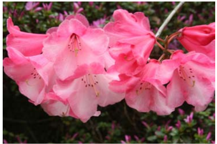
middle right R. 'Cornish Cross' - essentially a grex of varying degrees of attractiveness from a thomsonii x griffithianum cross done by Rothschild in 1935, they all at least retained thomsonii's wonderful peeling bark.