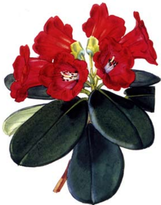
Engraving by Fitch, 1857 Curtis's Botanical Magazine

a particular creativity in evidence as the hybridizers searched for names for these progeny. Either that, or the sheer number of crosses made people look deep in their creative psyches for a name that was not already taken. But how can you resist such names as 'Blazing Petals', 'Banned in Boston', 'Black Prince', or my personal favourite, 'Aroma from Tacoma', a Loderi cross from Hjalmer Larson.